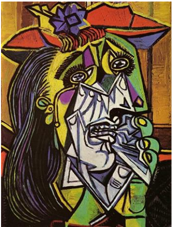
The Weeping Woman

The 'Weeping Woman' is a painting in the style of Cubism.